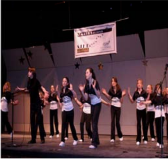
Stagekids Team Elite Performers performing for the Mequon Recreation Department

Summer programming is still in full swing and summer classes are still available for registration, but here are some highlights from this summer..